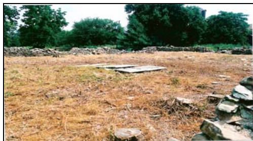
Your gift will help restore and protect these gravesites.