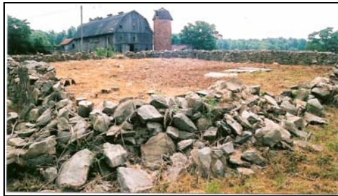
Your donation can help repair this wall.